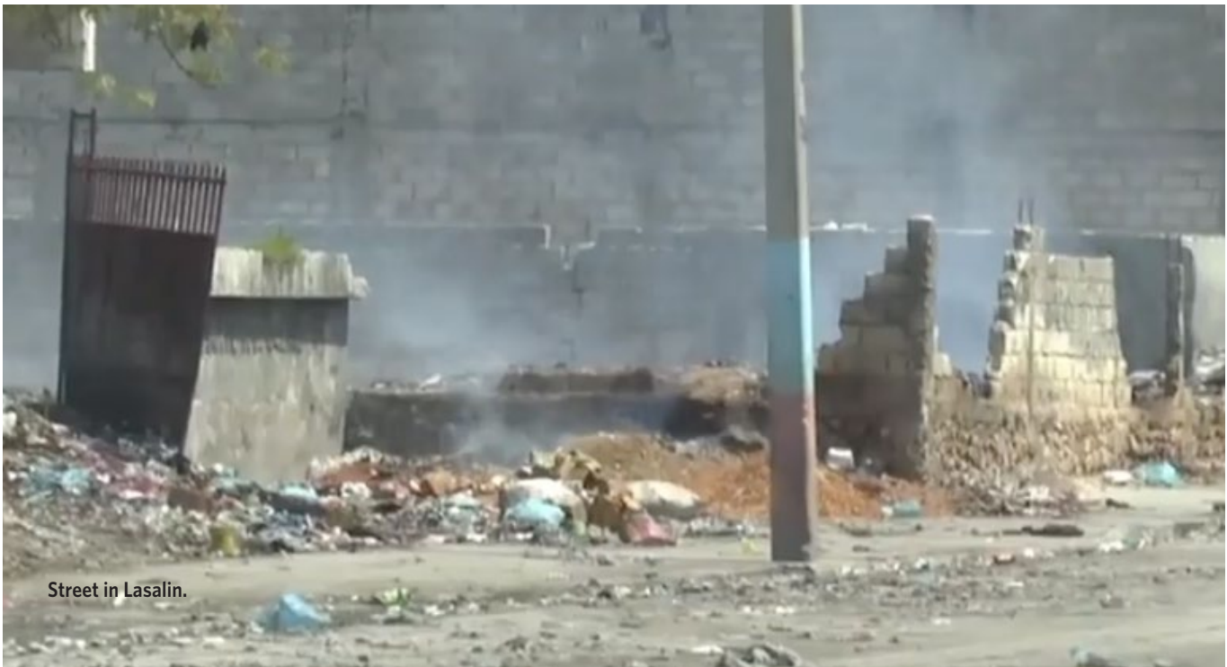
Street in Lasalin.

As a separate part of our investigation we also met with human rights lawyers from the office of Cabinet Masionneuve & Associes in order to hear about further aspects of government repression. Hundreds of people have been arrested since the first anti-government demonstrations began in August. Often, those arrested are summarily thrown in jail with no paperwork or any charges. Families are forced to wait for days in order to determine where their relatives are being held. If they are lucky, they can locate them, but then charges must be filed and lawyers have to go through the complicated process of even getting a hearing.