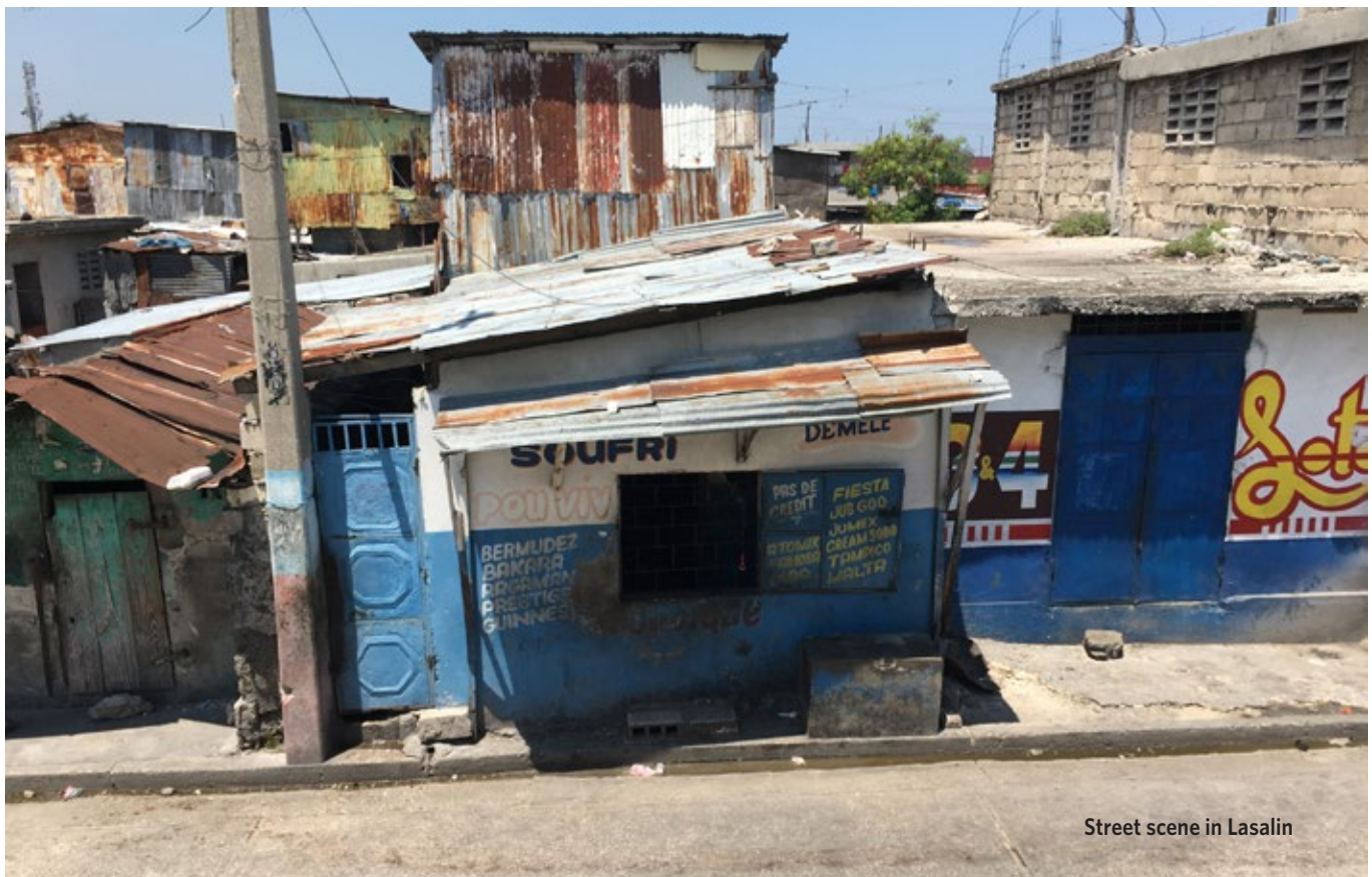
Street scene in Lasalin