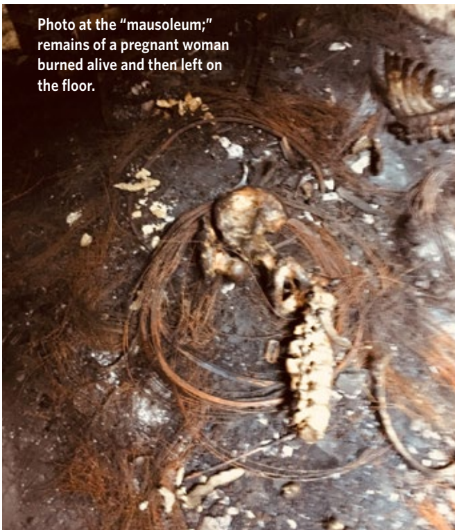
Photo at the “mausoleum;” remains of a pregnant woman burned alive and then left on the floor.

“I want to see more follow-up from this human rights delegation because what’s going on in Lasalin right now is something that needs to stop, because what’s going on here in Lasalin is political. It’s really orchestrated by the actual government that pays these guys to perpetrate all of these violations....And now they have all kinds