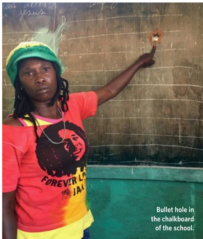
Bullet hole in the chalkboard of the school.

One person after another described how their relatives were killed, many hacked and/or burnt to death. People we interviewed said, “This neighborhood has been made a mausoleum. There is no water, no hospital and no school.” They repeatedly told us, “This is a humanitarian crisis. People are not living as human beings.” Photographs of the aftermath document bodies being left to rot, to be eaten by pigs or dogs. Others