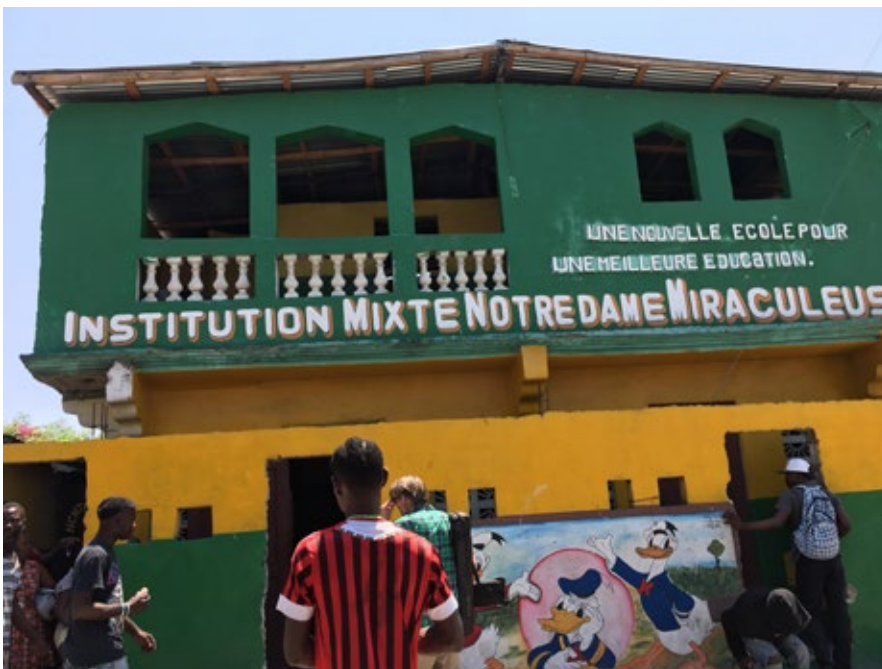
They also took us to a small school riddled by bullets. We were told that five students and two teachers had been killed there.

identify 71 murdered. However, residents and local human rights defenders maintain that this number is deplorably low, based only on the number of bodies actually left on the ground and not taking into account either those buried or taken away. 16 The RNDDH report lists the names of the victims and describes in detail how each victim was killed, some being hacked to death with machetes with their body parts fed to pigs, some being burned alive, others being riddled with bullets. 17 The methodology employed by the RNDDH to reach these findings involved, among other steps, interviewing four hundred and thirty-nine (439)