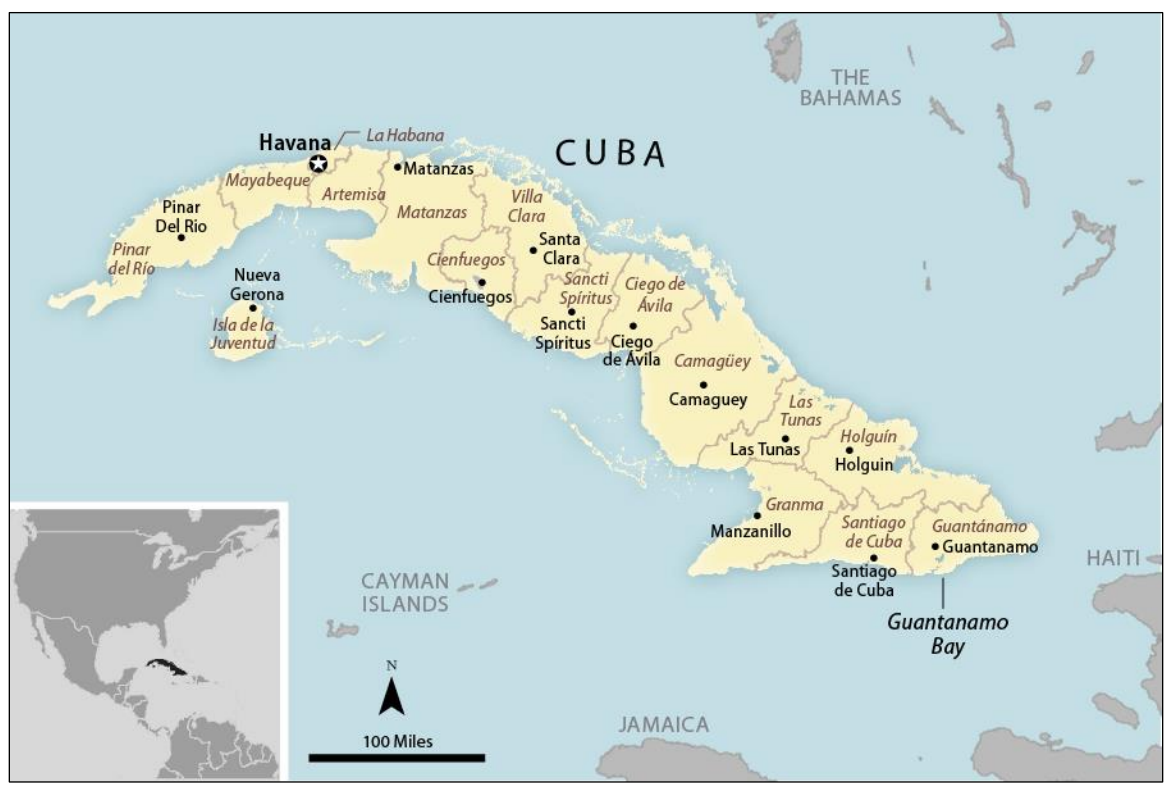
Figure I. Provincial Map of Cuba

Since 2019, the Trump Administration has significantly expanded U.S. economic sanctions on Cuba by reimposing many restrictions eased under the Obama Administration and imposing a series of strong sanctions designed to pressure the government on its human rights record and for its support for the Nicolás Maduro government in Venezuela. These actions have included allowing lawsuits against those trafficking in property confiscated by the Cuban government, tightening restrictions on U.S. travel and remittances to Cuba, and engaging in efforts to stop Venezuelan oil exports to Cuba.