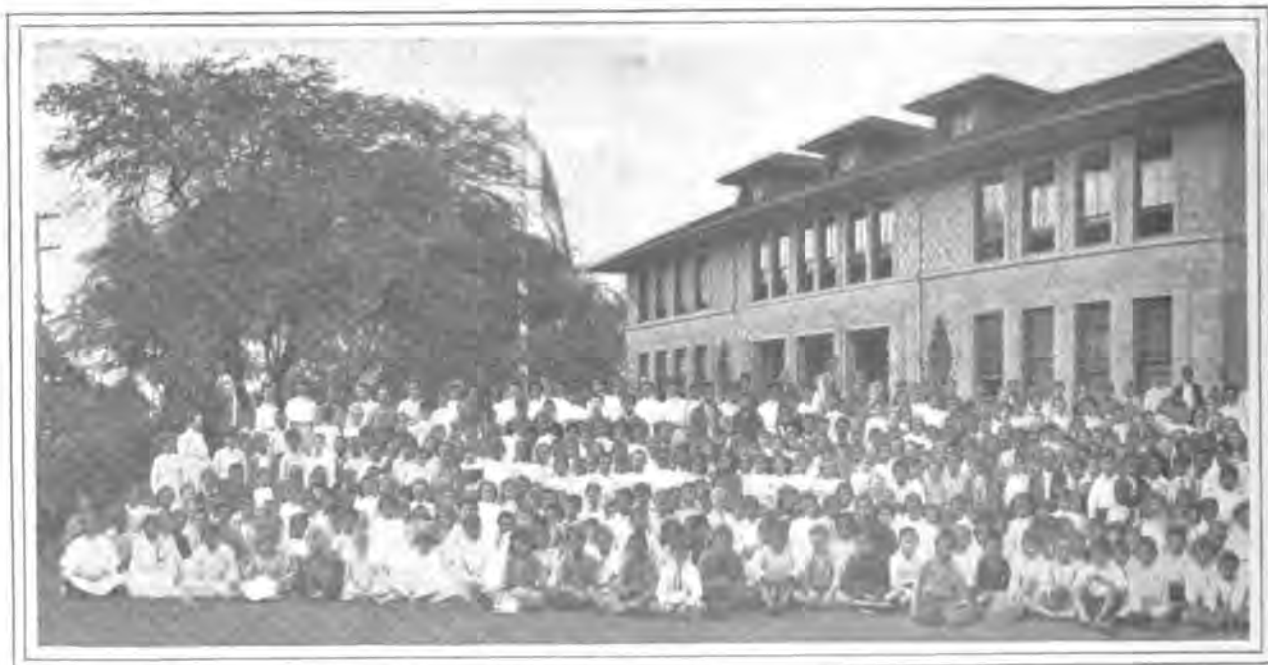
The Pupils of the Kaahumanu Elementary Grades Public School at Honolulu

THIS PHOTOGRAPH, THE CONTINUATION OF WHICH WILL BE FOUND ON THE OPPOSITE PAGE, GIVES A COMPREHENSIVE IDEA OF THE MANY NATIONALITIES HAWAII HAS PEACEFULLY ACCOMMODATED IN THE CLASS-ROOMS OF HER SCHOOLS, AND HOW SHE HAS SET A LESSON FOR CALIFORNIA'S SCHOOL BOARD