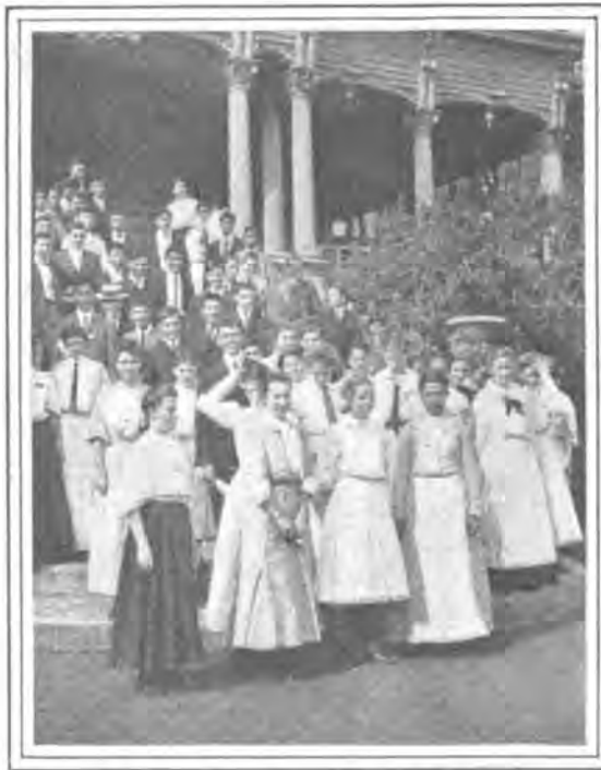
A Group at the Honolulu High School