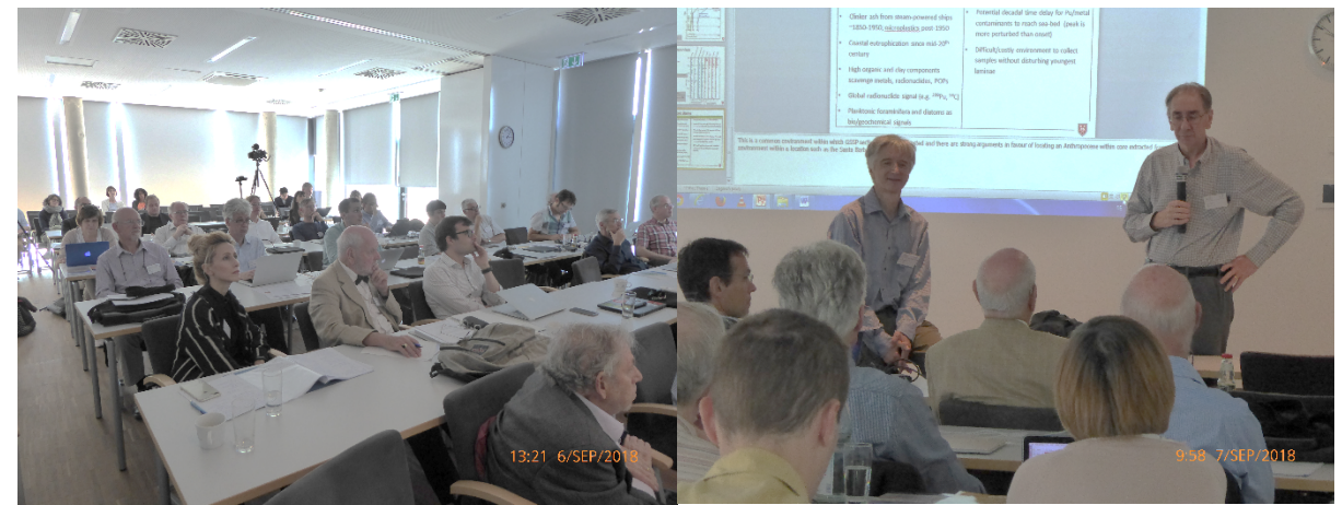
Discussions at the Max-Planck Institute for Chemistry, Mainz.