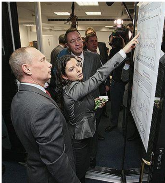
Simonyan shows RT facilities to then Prime Minister Putin. Simonyan was on Putin's 2012 presidential election campaign staff in Moscow (Rospress, 22 September 2010, Ria Novosti, 25 October 2012).