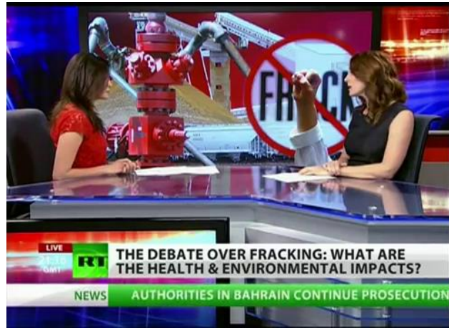
RT anti-fracking reporting (RT, 5 October)