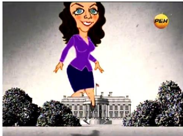
Simonyan steps over the White House in the introduction from her short-lived domestic show on REN TV (REN TV, 26 December 2011)